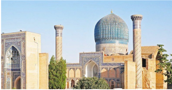
Guri Emir, Amir Temur Mausoleum in Samarkand