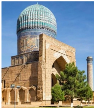
Jewel of Samarkand: the Bibi Khanym Mosque