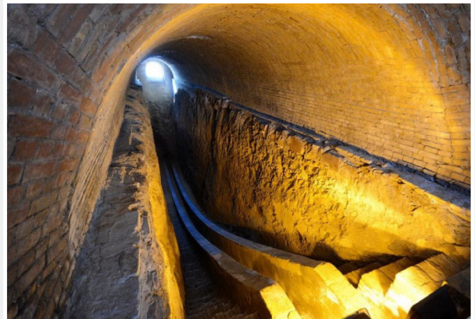
Observatory of Ulugbek, Samarkand