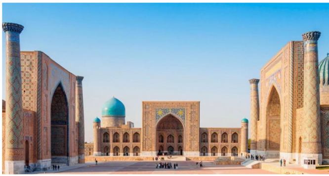
Registan Square in Samarkand