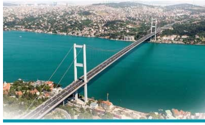
INTERNATIONAL ASSOCIATION OF OPERATIVE MILLERS - EURASIA INTERNATIONAL CONFERENCE & EXHIBITION FEBRUARY 10-13, 2022 Istanbul Lutfi Kirdar International Convention and Exhibition Centre